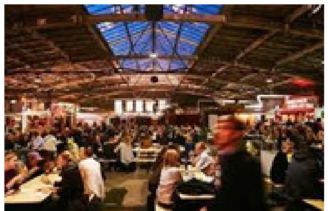
Repas au Street Food de Aarhus par Blanche Brulé et Thibault Seguin

dishes and much more. There is also a large selection of non-alcoholic drinks, craft beers, wine, cocktails and much more. Moreover we can eat inside or outside