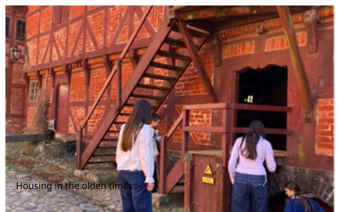
Housing in the olden times

The museum is made up of different houses where one has free access and where one immerses oneself in the lives of different people in times that we have not known.