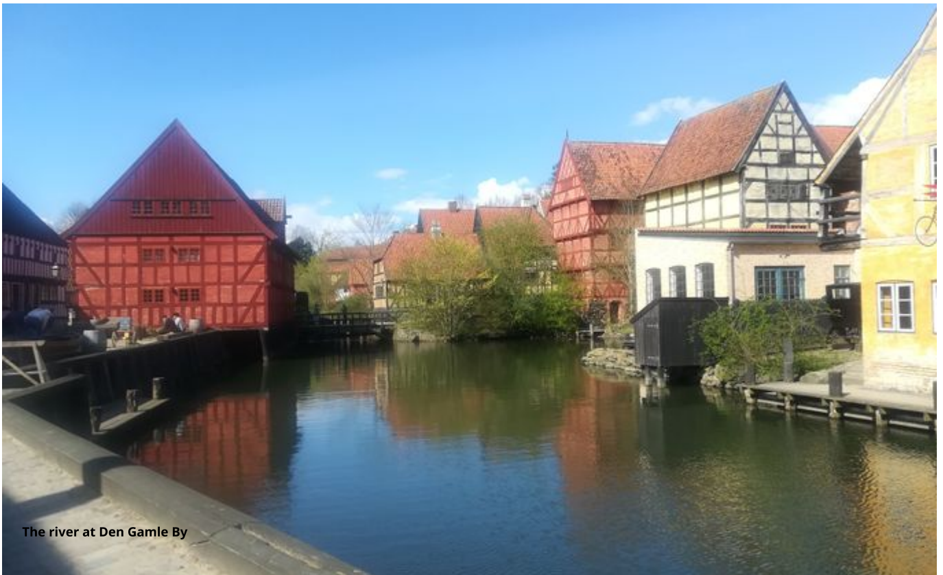
The river at Den Gamle By