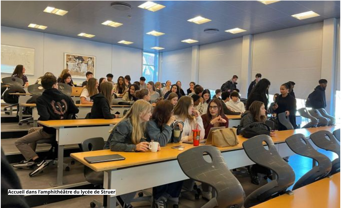
Accueil dans l'amphithéâtre du lycée de Struer

Pour la 4 ème année consécutive, du 29 mars au 4 avril, nous avons emmené un groupe d'élèves de la classe européenne à Struer (Danemark). A leur retour les élèves ont rédigé des articles (en anglais et en français), pour partager leurs expériences. Les élèves qui n'ont pas participé à l'échange ont apporté leur contribution à ce magazine en mettant à l'honneur l'Union Européenne. Merci à tous pour votre participation à cette édition de l'Euomag. Merci aux collègues de Struer pour leur accueil, et bonne lecture ! Thank you !