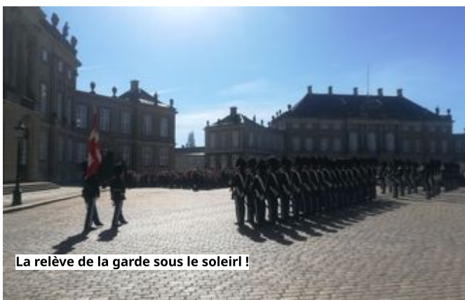
La relève de la garde sous le soleil !

Visite à la Petite Sirène, la relève de la garde, le Musée National et un peu de shopping dans les rues piétonnes avant notre retour à Amiens !