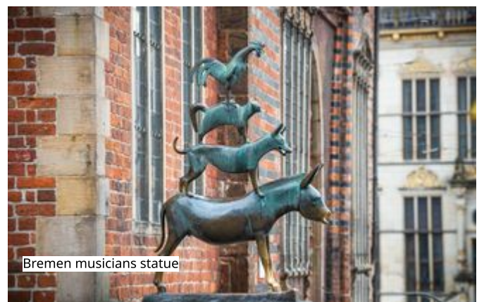
Bremen musicians statue