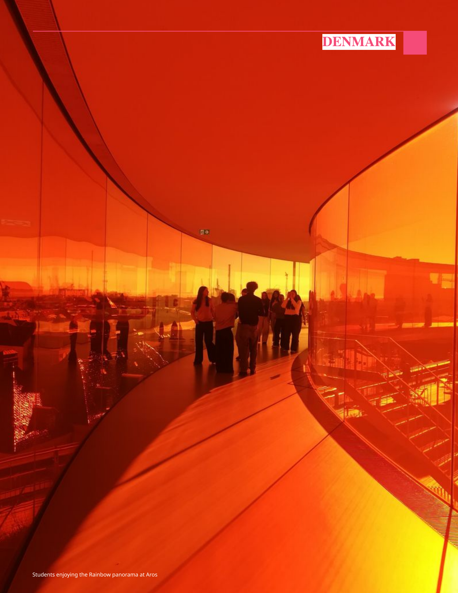
Students enjoying the Rainbow panorama at Aros