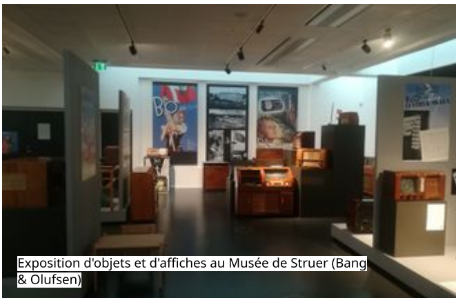
Exposition d'objets et d'affiches au Musée de Struer (Bang & Olufsen)

Struer abrite le musée Bang & Olufsen, dédié à la célèbre entreprise danoise, réputée pour ses radios, enceintes et autres équipements audio haut de gamme. Le musée présente les produits emblématiques de la marque, de ses débuts en 1925 à nos jours, et propose une variété d'activités interactives axées sur le son et l'écoute. Les visiteurs peuvent explorer des expositions retraçant l'histoire de l'entreprise, ses innovations en matière de design et même participer à des expériences sonores interactives.