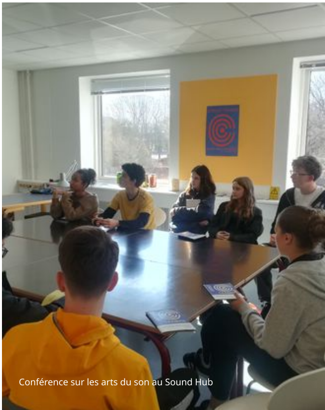
Conférence sur les arts du son au Sound Hub

The boarding school in Struer was very cosy and peaceful. Everybody is free and can go anywhere at anytime. There is a cinema, a music room, a gym, a playstation room and more, it is open to everybody living in the boarding school. There is food displayed most of the time and you can eat as much as you want. We can also borrow bikes to go out in town.