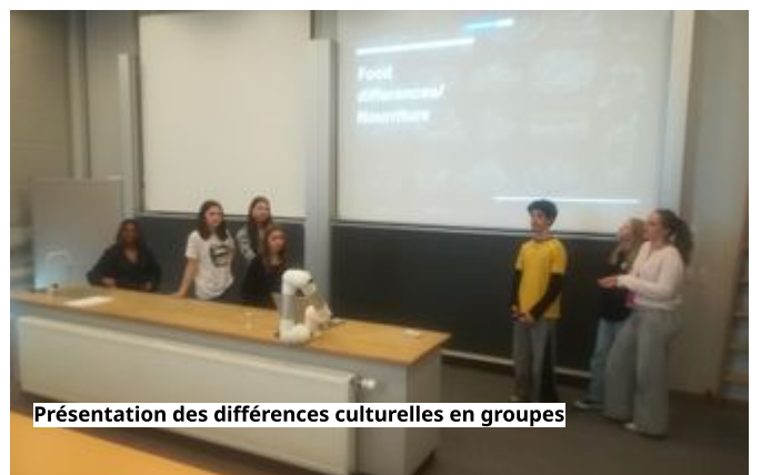
Présentation des différences culturelles en groupes

Notre première journée s'est déroulée au Struer Statgymnasium avec le mot du proviseur, un petit en cas et la présentation des activités et visites de la semaine. Our first day at Struer Statgymnasium!