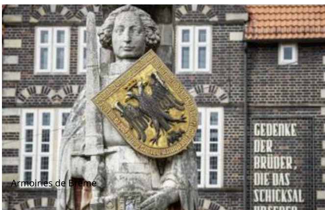
Armoiries de Breme

Bremen, located in the north western part of Germany, is one of the country's most historic and charming cities. Known for its rich culture, beautiful architecture, and maritime history, Bremen offers visitors a unique experience.