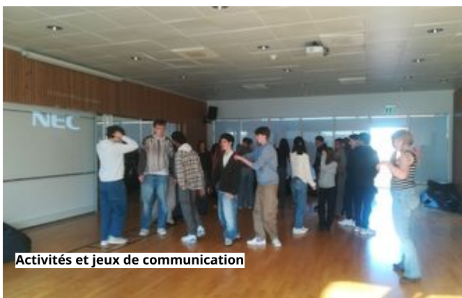
Activités et jeux de communication