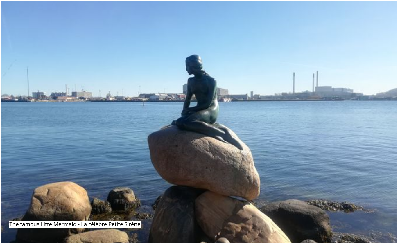
The famous Litte Mermaid - La célèbre Petite Sirène