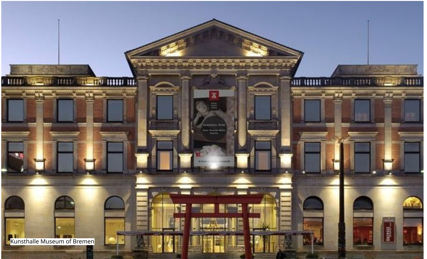
Kunsthalle Museum of Bremen