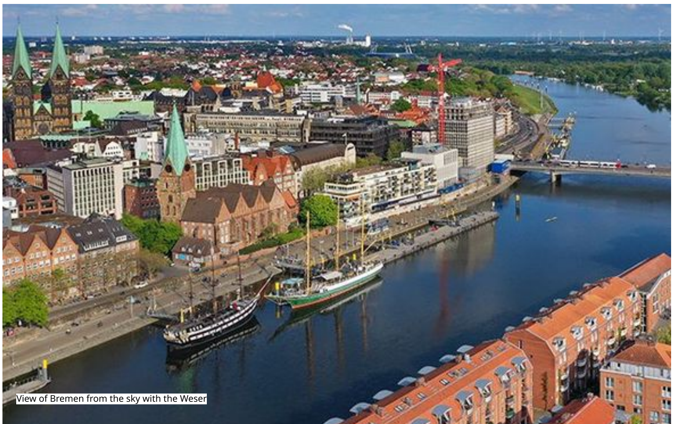
View of Bremen from the sky with the Weser