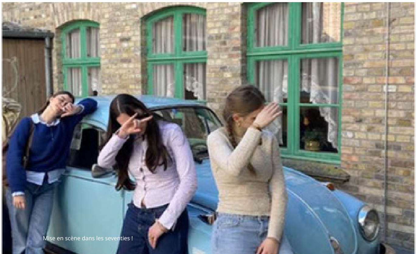
Mise en scène dans les seventies !