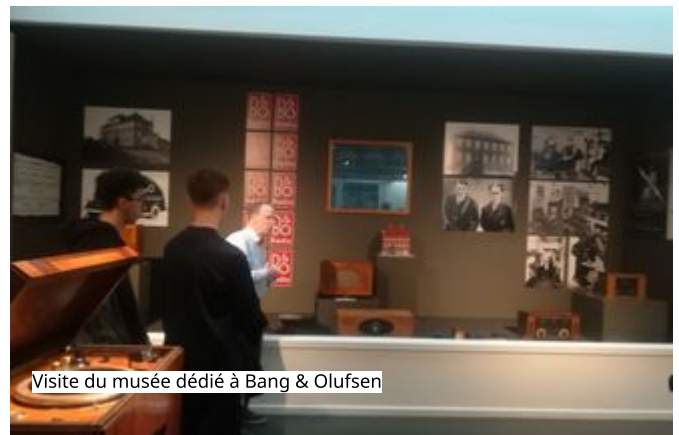
Visite du musée dédié à Bang & Olufsen