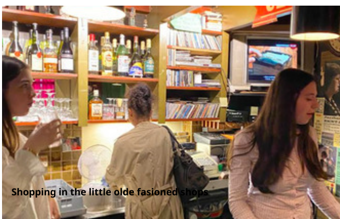
Shopping in the little olde fashioned shops